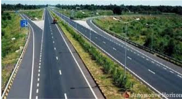
Roads & Highways