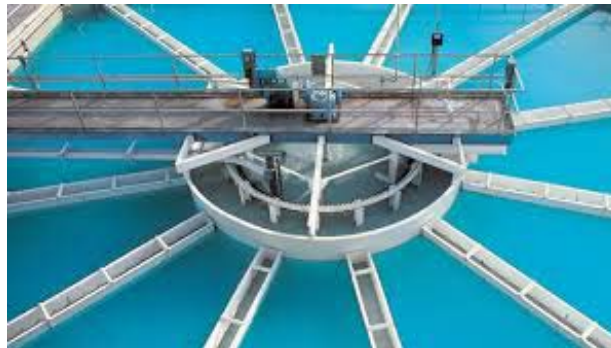
Water and Wastewater